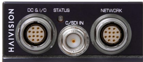
Makito X1 Rugged (Actual size)